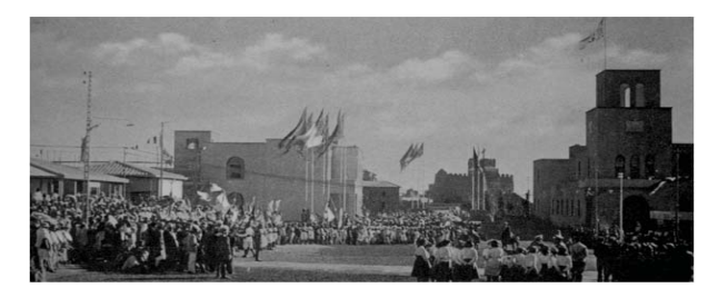
Rally in the administrative district. The Comando truppe (right) and the Circolo militare (left) frame the axis looking toward the castle of Ras Biet in the distance.