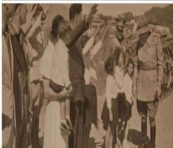
Rallies in Gondar in honor of the Viceroy's visit, 1938.