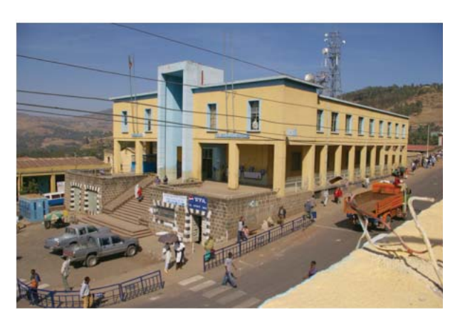
The post office anchors the north end of the commercial district.