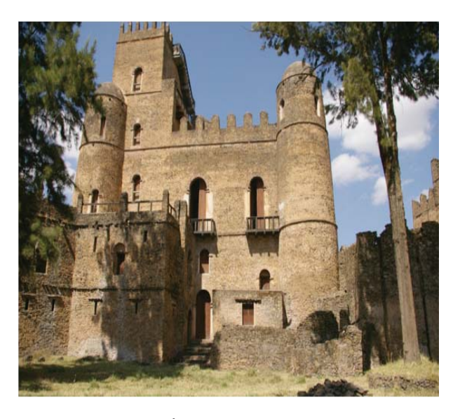
The castle of Fasiladàs.